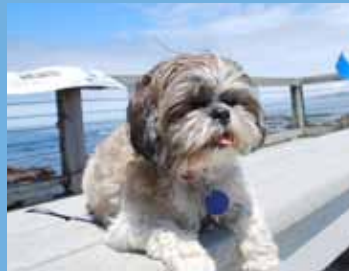
"Jazzy" by the NW SPCA Board

We had to take extra space here to remember "Jazzy," a very special dog who belonged to the family of a very special person on the NW SPCA staff.